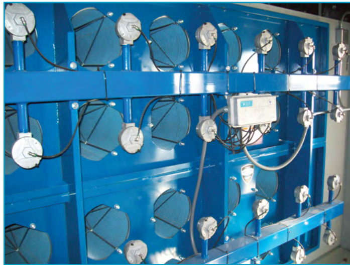
Self-Cleaning Cartridge Filter Array