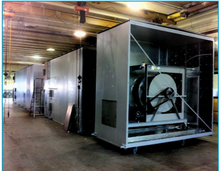
Flexible Designs to Meet Customers' Needs