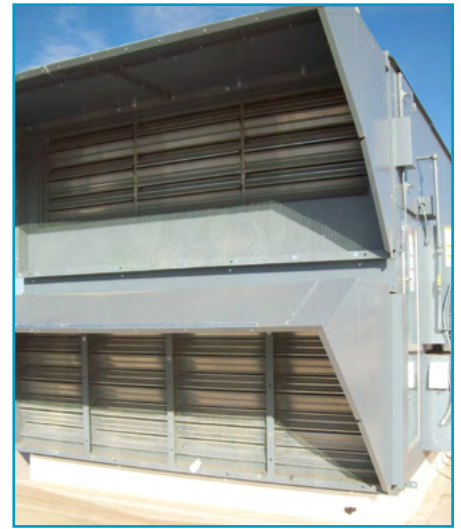
Economizer and Outside Air Inlet

Filtering dust, smoke or oil can promote a cleaner, healthier work environment, reduced operating cost and improved productivity.