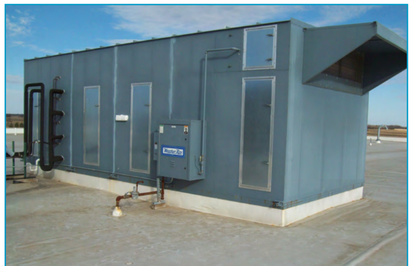
Customized Unit for Heating, Cooling and Make-Up Air

Exhaust extracted from a building to atmosphere must comply with EPA (Environmental Protection Agency) regulations and local ordinances. Air handlers configured with building exhaust filtration option, filter exhaust air to minimize contaminants, promoting a cleaner environment and helping reduce pollution.