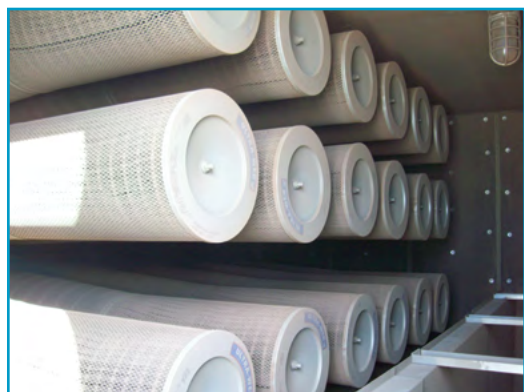
After Five Years