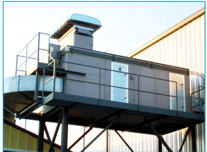
Heating-Only Application for Weld Smoke Removal