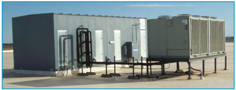
Heating and Cooling Application for Dust Collection

Air handler customization can combine make-up air systems and varying levels of filtration to provide economical total building capture, helping eliminate the need for multiple HVAC systems, reducing equipment cost compared to source capture systems.