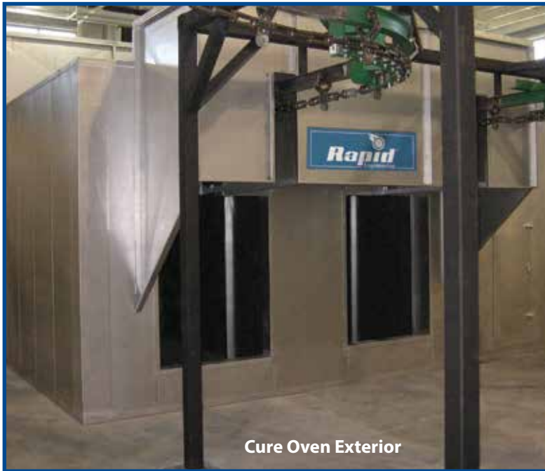
Cure Oven Exterior