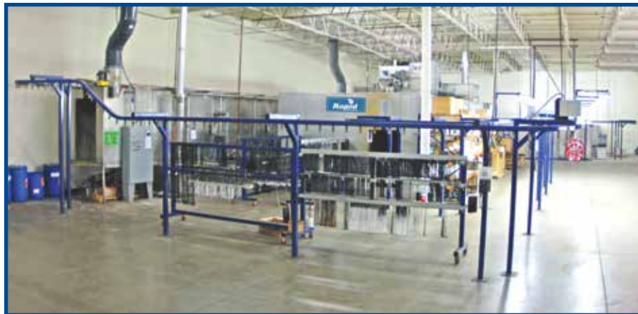
RAPID® Econo-Series Finishing System Application