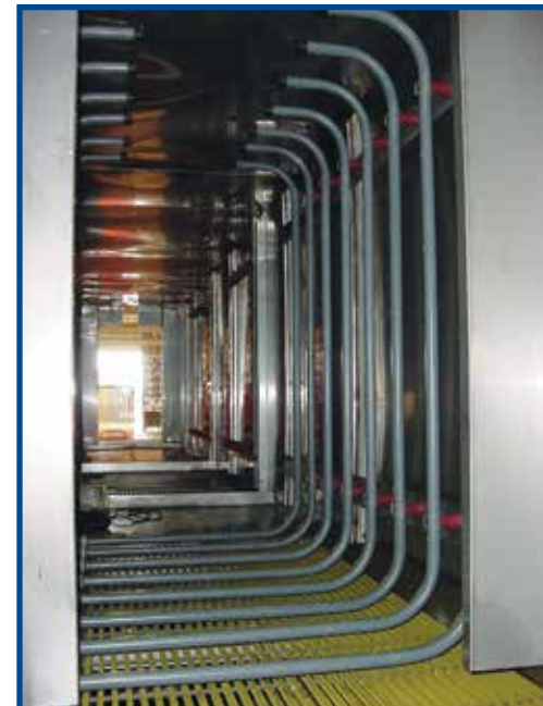
Econo-Series Washer Interior