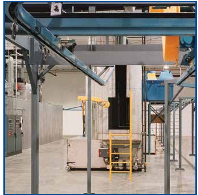
RAPID® Econo-Series Washer