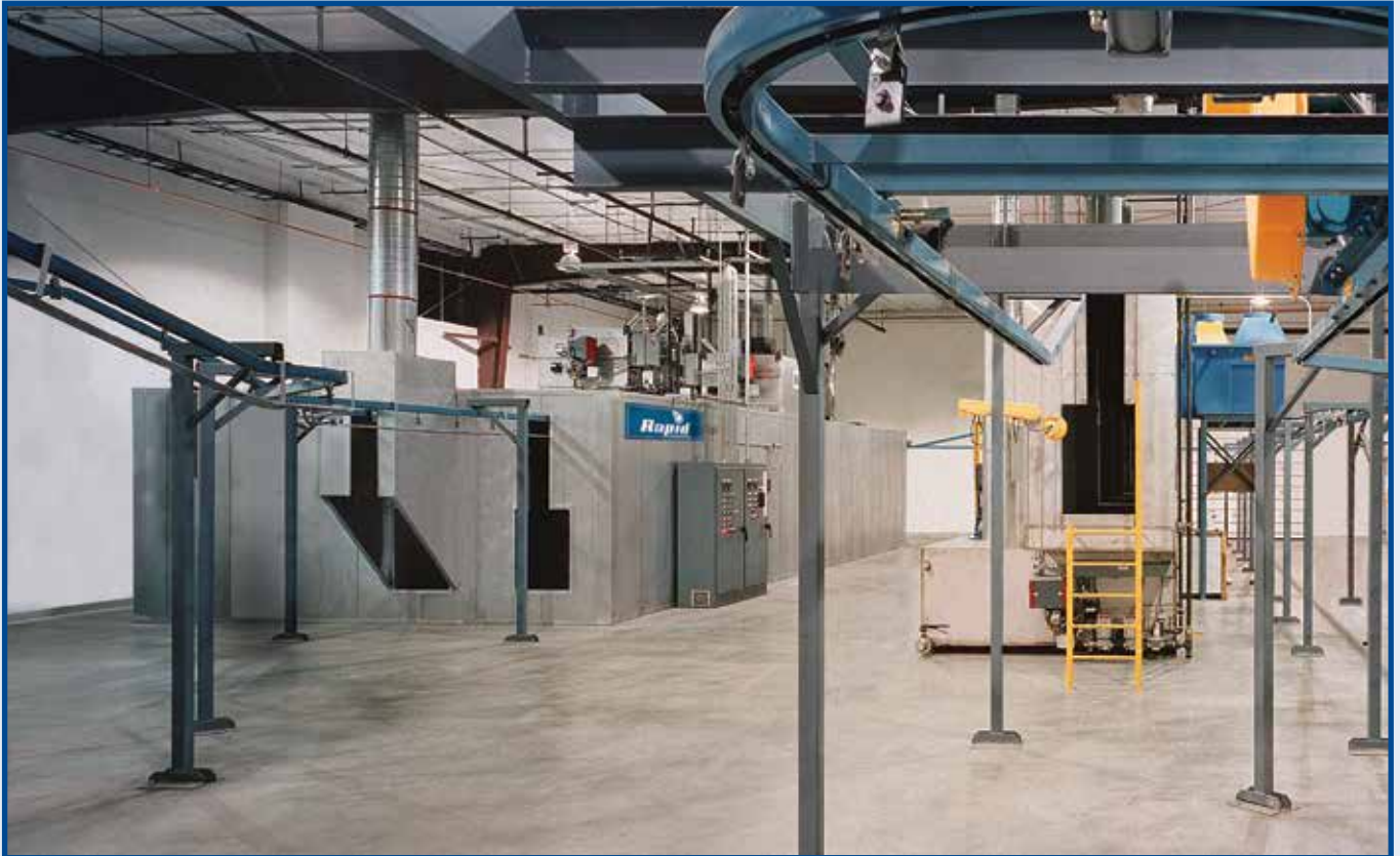
A typical RAPID ® finishing system with five-stage washer, dry-off oven, cure oven, conveyor and controls.