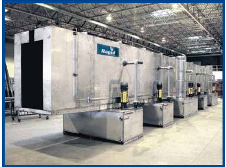
The RAPID® Econo series multi-stage washer was specifically designed to meet common manufacturing product sizes and required production throughput from 4 to 8 feet per minute.