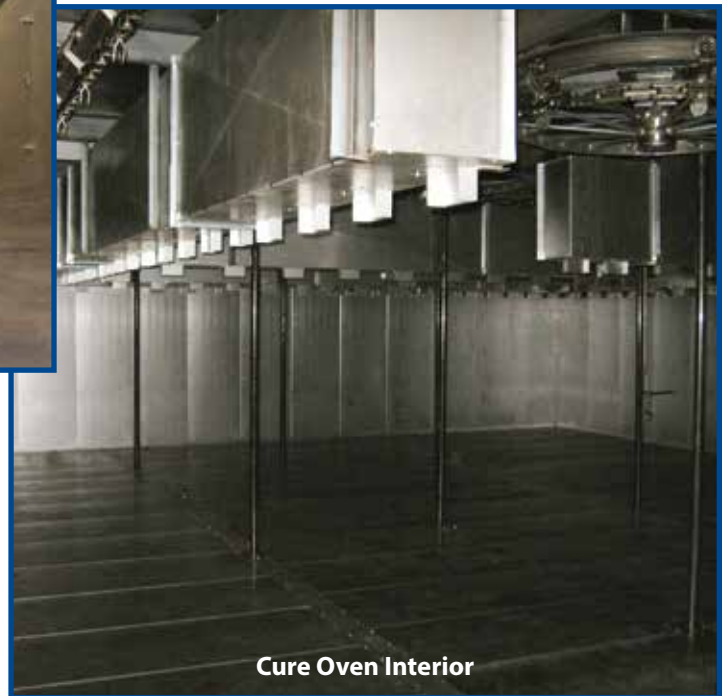
Cure Oven Interior